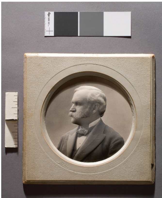
Bas-Relief Photographic Portrait of Amzi L. Barber, ca. 1900

This academic year two historically significant portraits in the Oberlin College Archives received treatment by the Intermuseum Conservation Association (ICA), Cleveland. The conservation activity was made possible with income from the endowed Hunt Fund for Preservation and Digital Access established in 2007. This fund enables the Oberlin College Archives to undertake preservation, conservation and digital access projects for artworks, recordings, photographs, and other objects in need of treatment, stabilization and/or migration to new media. Without this dedicated fund, the Oberlin College Archives would not be able to proceed with preservation projects, especially during the financial downturn of the past year. Emeritus Archivist Roland M. Baumann established the Fund in the last years of his tenure as College Archivist.